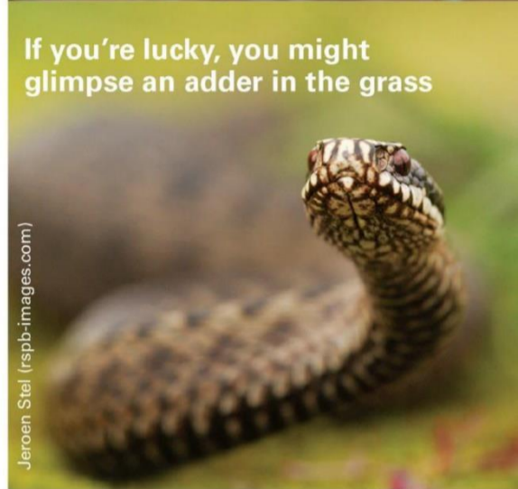
If you're lucky, you might glimpse an adder in the grass